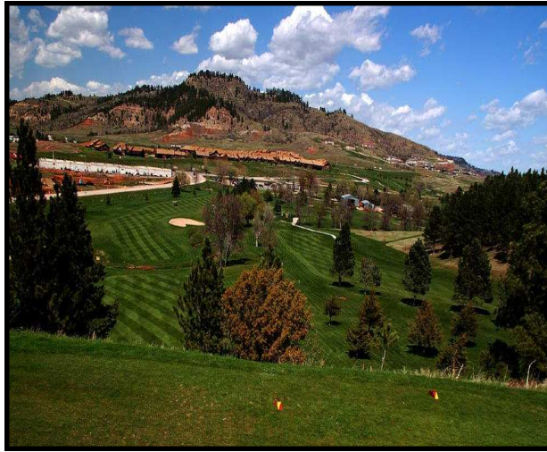
A picturesque look down hole 9 fairway.

Please pay special attention to our website and newsletters as we are planning some new member events for 2010. We will post event information as soon as the schedule is completed.